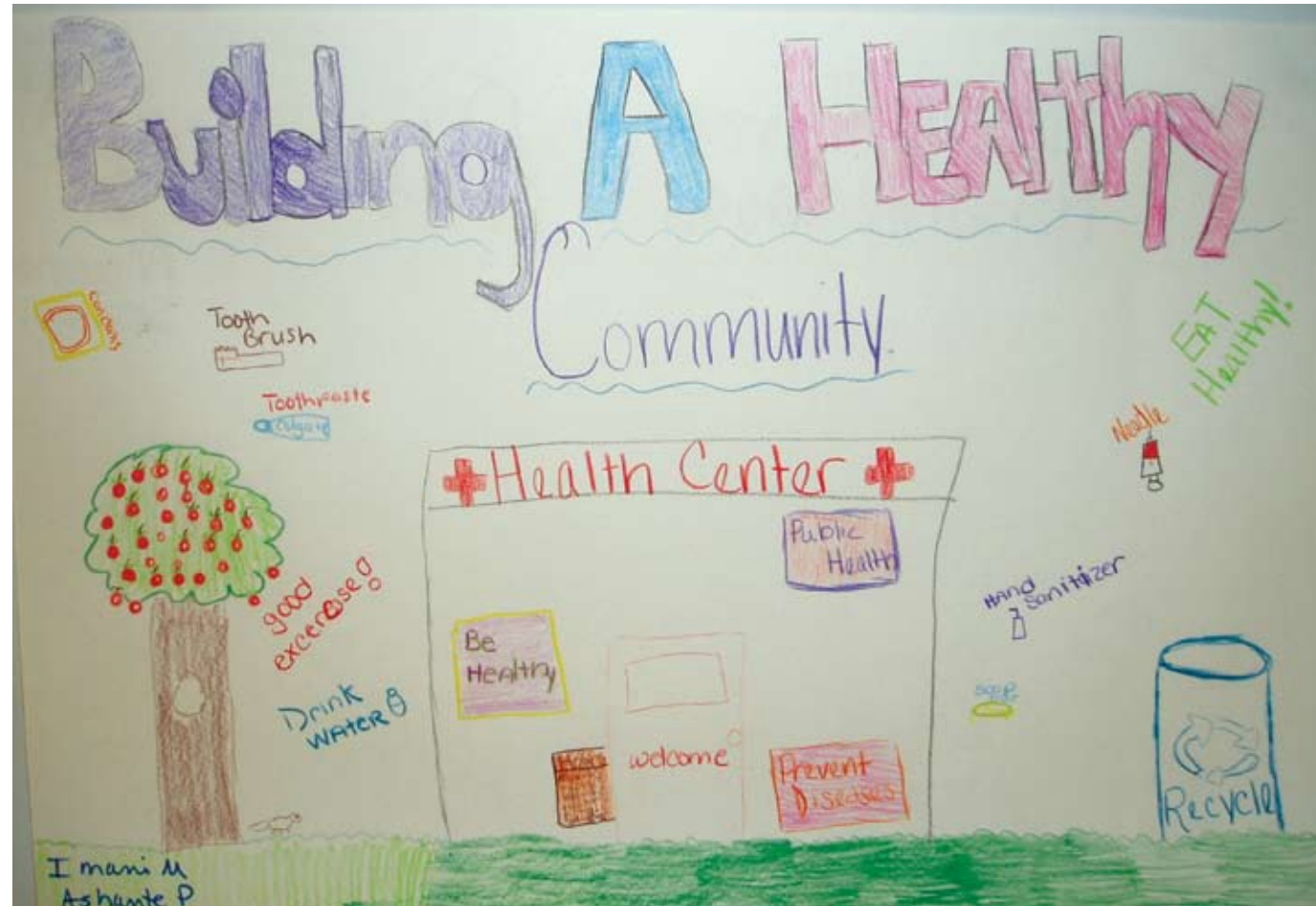
An illustration created by two Chicago grade-school students for a poster contest organized by the Urban Health and Diversity Programs during National Public Health Week.