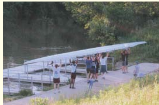
(Right) Members of a local rowing team collaborate with the CHEERS project to facilitate recruitment into the study.

To keep track of the CHEERS team, visit www.cheerschicago.org .