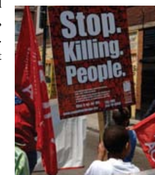
The Chicago community responds with a peaceful street demonstration to raise awareness for violence prevention.