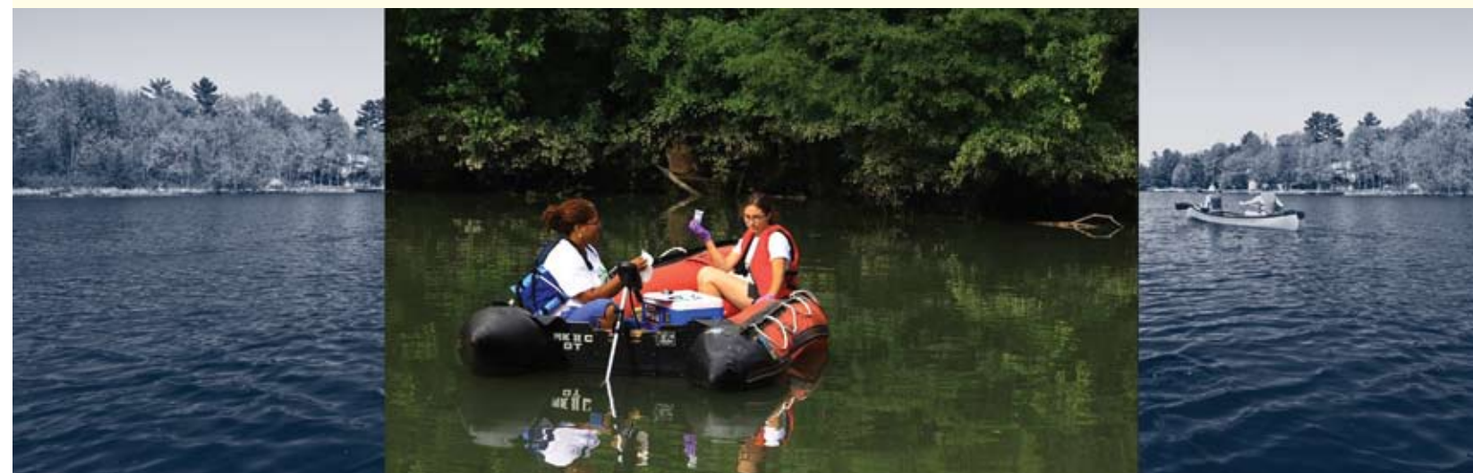
(Below) Members of CHEERS research staff collect water samples for microbial testing on the Chicago waterways.